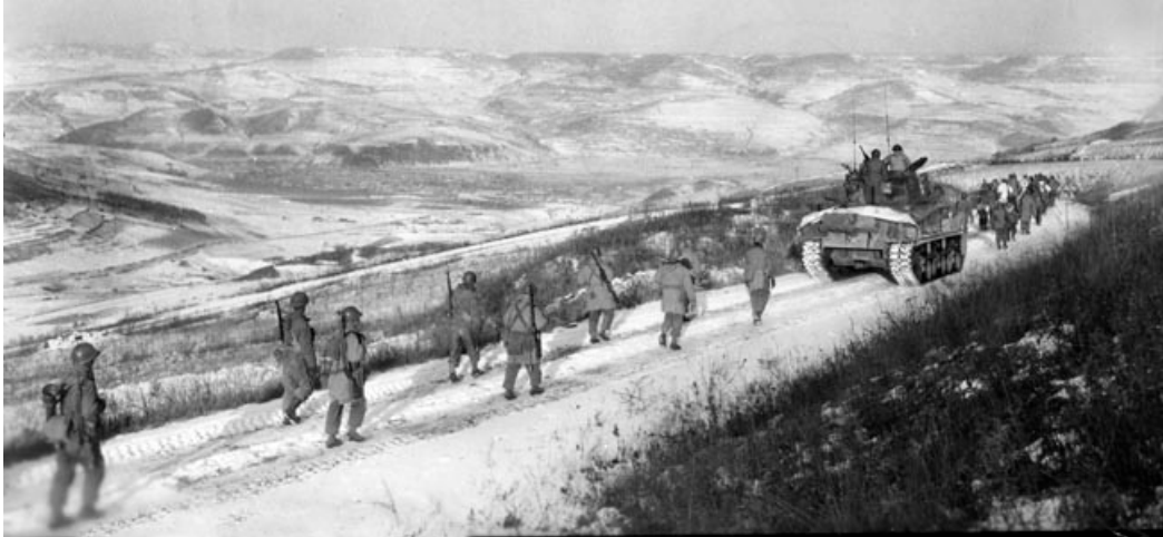
A U.S. combat team fought against overwhelming odds in late November 1950 at the Chosin Reservoir. It bought precious time for other units.