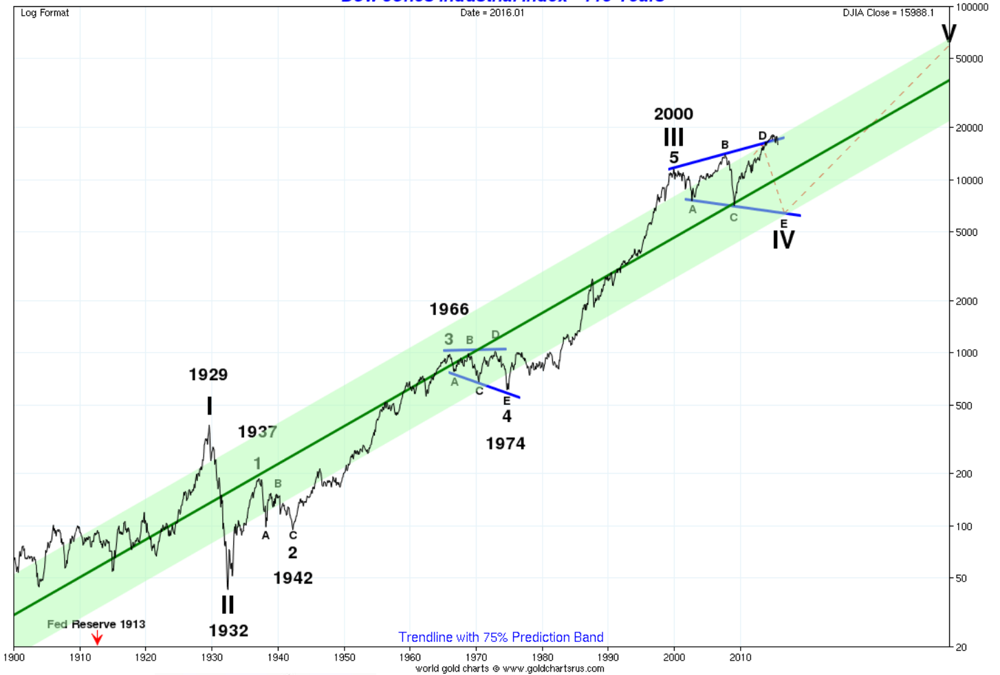
Dow Jones Industrial Index - 110 Years