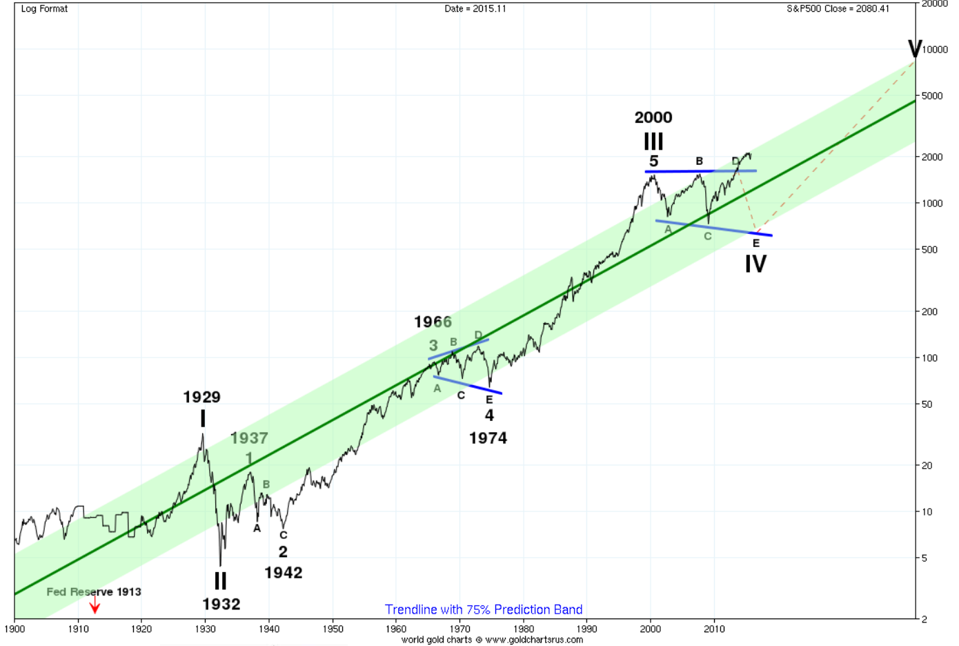
S&P500 Index - 110 Years